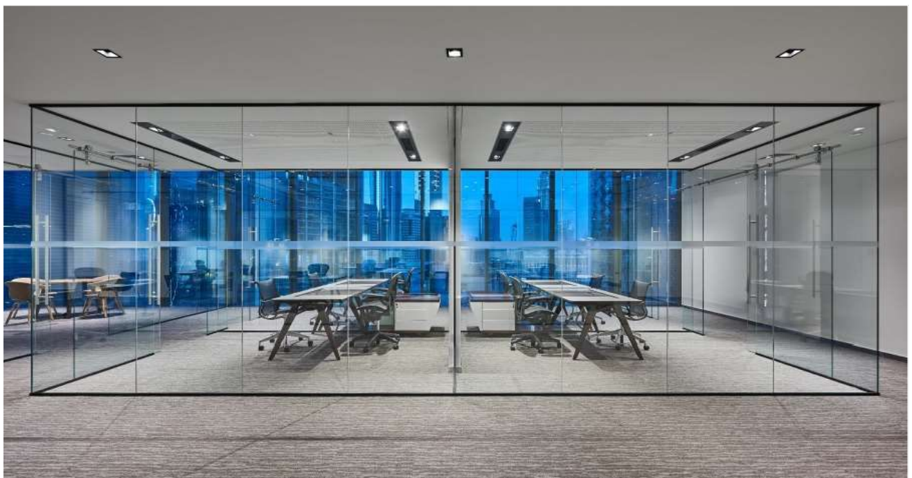
Environmental Product Declaration of Glass Partitions and Doors